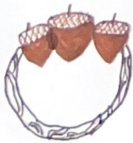
- from above, overall ring